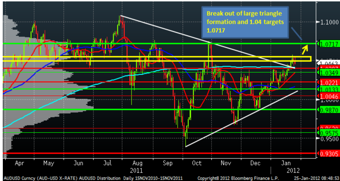
Figure 2: Daily AUD/USD chart

Price is now in a short-term pull back to test the resistance-turned-support and a hold would most likely attract fresh longs for a test of 1.0717 but at least 1.06.